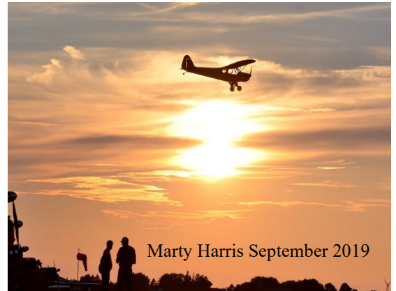
Marty Harris September 2019

It is abundantly clear as day turns to night, I once again have fallen in